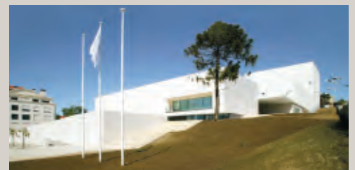
Caldas Da Rainha Cultural Center